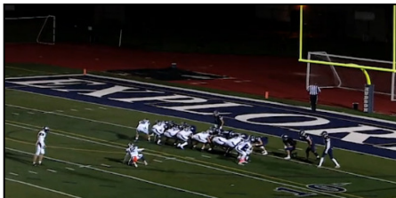
TWINSBURG LINED UP FOR GAME-WINNING FIELD GOAL VS HUDSON ON OCTOBER 19.

Twinsburg travels to Nordonia for a critical match-up in Week 10.